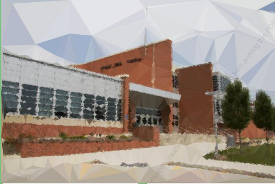
Illustration: Low Poly Art