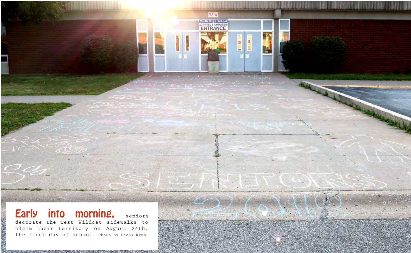
Early into morning, seniors decorate the west Wildcat sidewalks to claim their territory on August 24th, the first day of school.