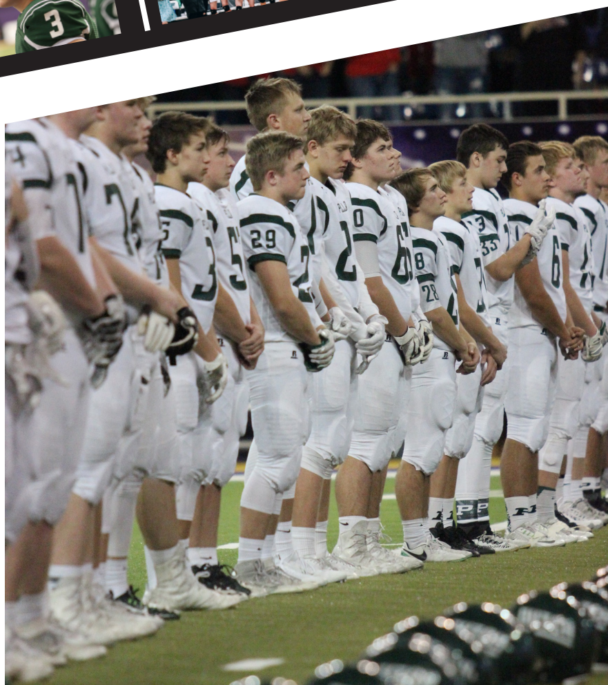
// The Dutch stand for the National Anthem before their game against Harlan.