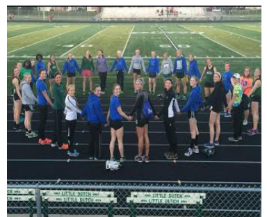
The team gathers on the football field after practice.