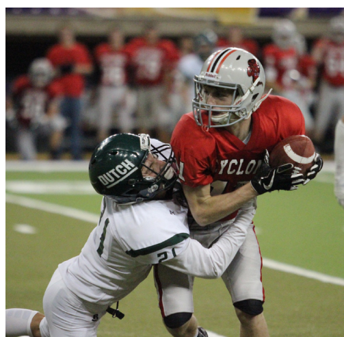
// Senior goes in for the tackle in the semi-finals.

The Pella Dutch football team headed back to the Dome for the fourth straight year. The Dutchmen first had to play a very tough Harlan team in the semi-finals, winning with a final score of 41-39. For the championship game they faced a familiar opponent from years' past, Xavier. The Dutch fought a tough game, but did not come out on top this year, losing 31-13.