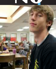
"Water is not wet, it makes other things wet." - Noah Lanphier