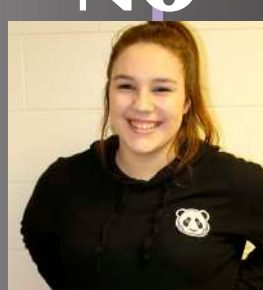
"Goldies, they add more toppings and don't make you pay for it." - Liz Young