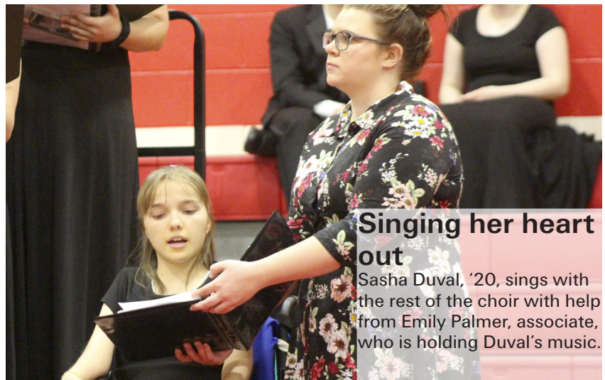
Singing her heart out

Page will be trimmed one pica in from this outside bleed line.