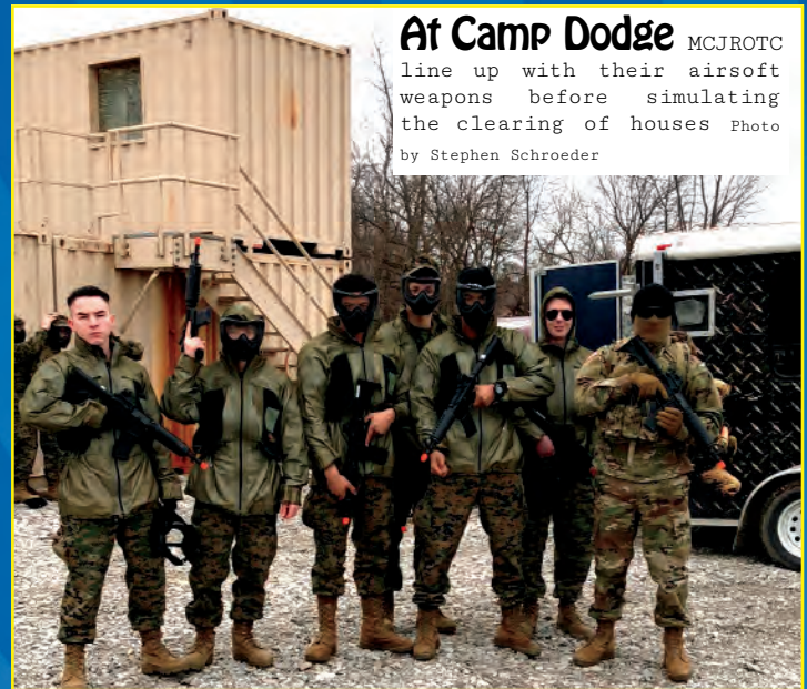
At Camp Dodge MCJROTC line up with their airsoft weapons before simulating the clearing of houses