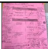
▶ TESTS. In AP Statistics, students take a quiz and are allowed to use this pink sheet with their notes on it. But when the AP test rolls around they will be given an empty pink sheet. The AP Statistics test is May 17, 2018.