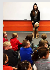
A Cedar Bend Humane Society rep speaks to @2nd_Graders.