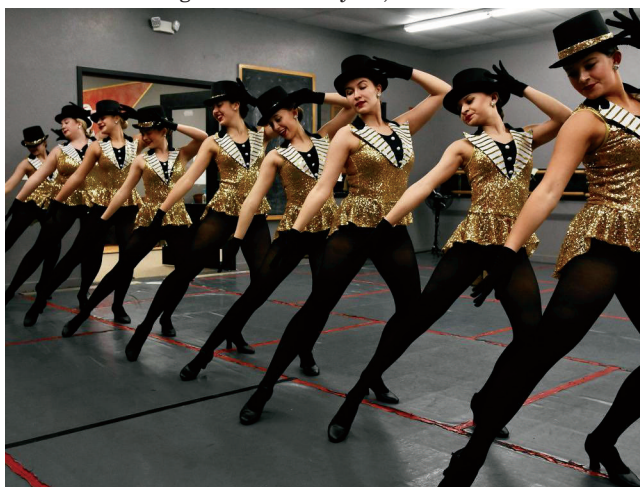
SPREAD BY: ERIN BAILEY